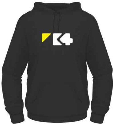
Hoody S, M, L, XL