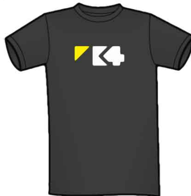
T-shirt S, M, L, XL