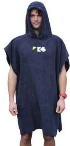
Changing Robe Free size